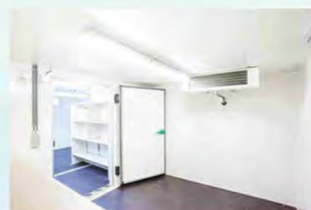
cold & fermentation rooms