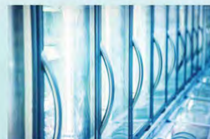
self-service shelves & fresh counters